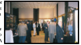
Conference attendees gather in exhibit/vendor area

On Day Two, leaders of the highway contracting and consulting community